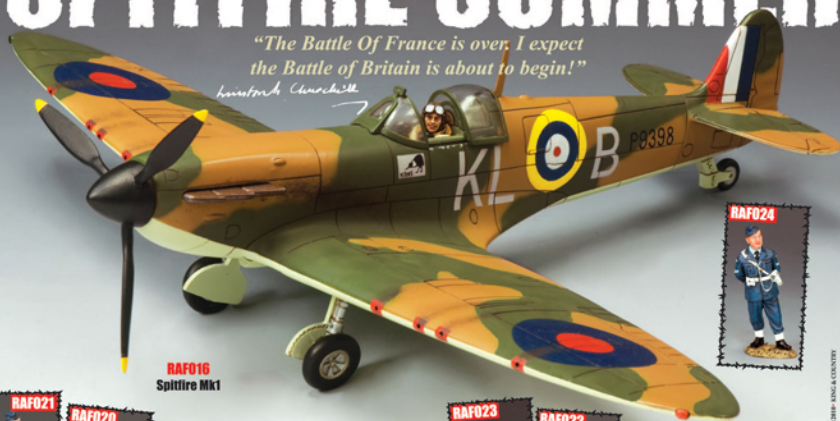
RAF016 Spitfire Mk1