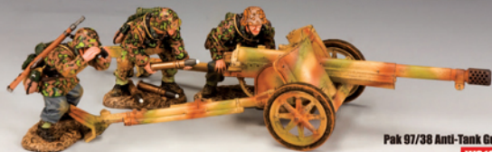
Pak 97/38 Anti-Tank Gun WS165

Available around the world wherever fine quality military miniatures are sold.