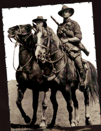
This original diorama was displayed at the Old Toy Soldier Show, in Chicago, in September 2010.

Suite 2301, 23rd Floor, No.3 Lockhart Road, Wanchai, Hong Kong Tel : (852) 2861 3450 Fax : (852) 2861 3806 E-mail: sales@kingandcountry.com