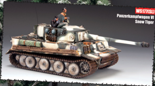
WS177(SL) Panzerkampfwagen VI Snow Tiger