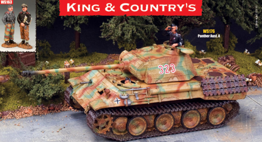
WS176 Panther Ausf. A