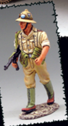
AK042 Marching AK Sergeant

S INCE 2002 King & Country has produced almost 50 different sets of figures and fighting vehicles portraying Erwin Rommel's famed AFRIKA KORPS in miniature.