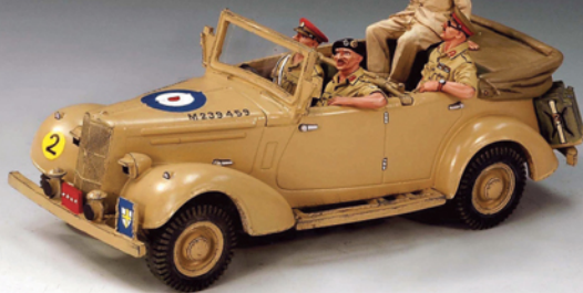
Churchill & His Generals (Strictly Limited)