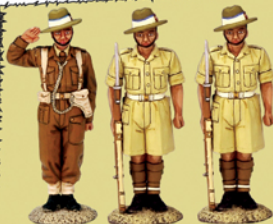
EA034 Saluting Gurkha Officer