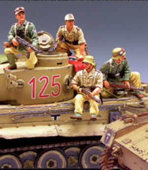
AK049 AK Tank Riders Set

At present our existing Afrika Korps sets are eagerly awaiting fresh reinforcements of additional infantry in action and, most importantly, extra armour... Don't worry they are both on their way!