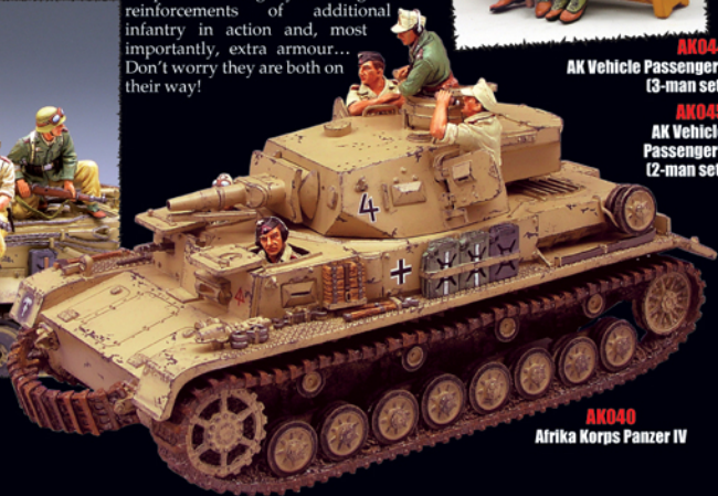
AK040 Afrika Korps Panzer IV