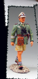
AK041 Marching AK Officer