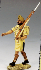
EA037 Sikh Indian Soldier