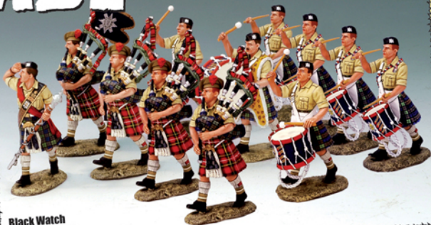
Black Watch Pipes & Drums

However, as soon as he was appointed he began to make his present felt... Incompetent officers were either sacked or demoted... more able ones promoted and practical realistic battlefield training was stepped up.