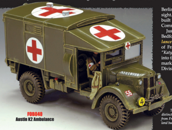
FOB040 Austin K2 Ambulance

Berlin the trusty Bedford was a familiar sight. More of this army transport were built than any other in the British and Commonwealth inventory.