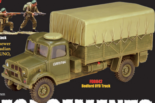
FOB042 Bedford OYD Truck

On the infantry side are DD064 "Tommy Patrol"... a Bren