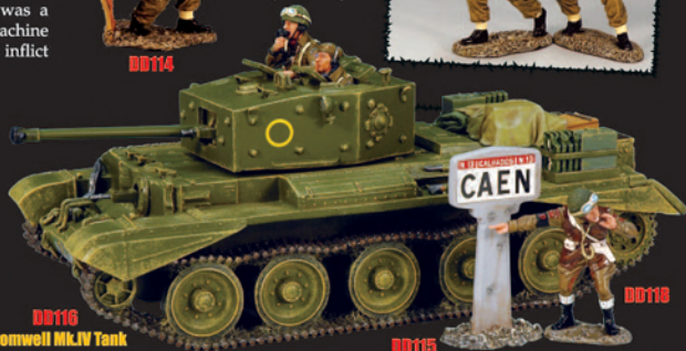
DD116 Cromwell Mk. IV Tank