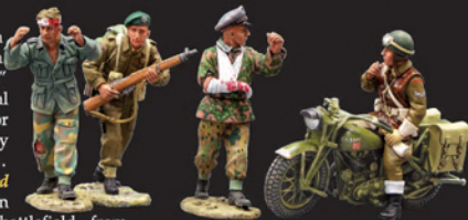
DD058 Taking Prisoners

FOB042 "Bedford OYD Truck"... Seen on every British battlefield from Belgium to Benghazi and on to the