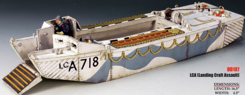
DD107 LCA (Landing Craft Assault)