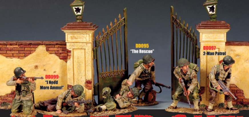
DD099 "I Need More Ammo!"