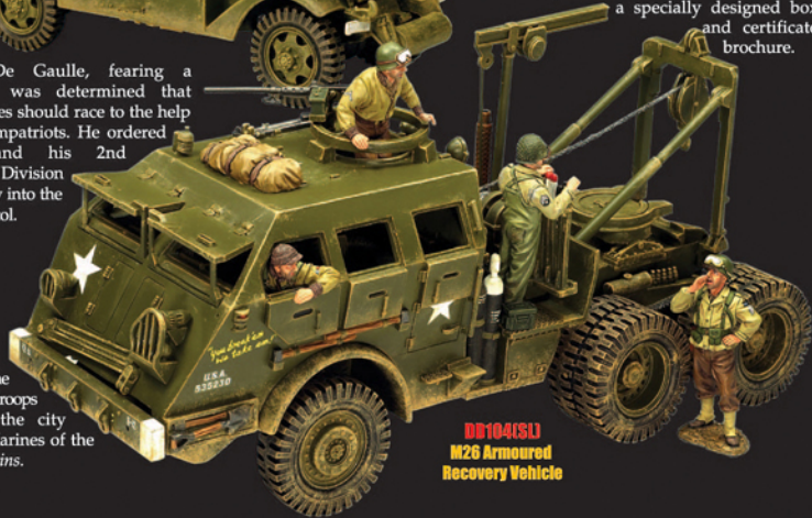
DD104(SL) M26 Armoured Recovery Vehicle

Among the Free French troops liberating the city were the Marines of the Fusilier Marins.