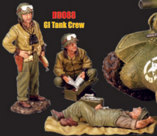
DD088 GI Tank Crew

M4 Shermans usually carried a crew of five and here's the other three... DD088 "GI Tank Crew". Watched over by a standing sergeant, two tankers prepare to inspect their "armoured chariot" for any battle damage or oil leaks!