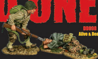
DD098 Alive & Dead

model comes with two crew figures and two detachable "back packs" of extra supplies that can fit onto the rear of the tank.