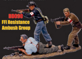
DD090 FFI Resistance Ambush Group

Their military equipment and weaponry comes from a wide variety of sources – French... German... British... and American. They intend to make every bullet... and bomb count... This is their battle... their country! And this is our tribute to them.