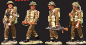
Advancing Tommies... A few of these are still available.

history. On the morning of June 6, over 160,000 primarily British, Canadian and American troops crossed the English Channel and landed on 5