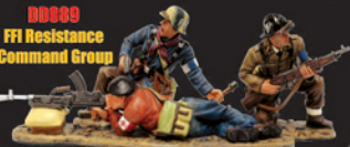
DD089 FFI Resistance Command Group

Behind these flames are the brave men and women of the Resistance... the "Maquis". Their battle is often lonely but always dangerous... Their enemies, both occupiers and local collaborators, are cruel... cunning... and ruthless. If captured, 'Resistants' can expect no mercy... only torture and death.