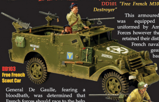
DD103 Free French Scout Car

General De Gaulle, fearing a bloodbath, was determined that French forces should race to the help of their compatriots. He ordered Leclerc and his 2nd Armoured Division fight its way into the French capitol.