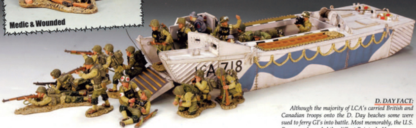
D. DAY FACT:

of the East Yorkshire Regt. of the 3rd. British Infantry Division which landed on Sword Beach on the morning of June 6, 1944.