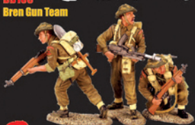
DD106 Bren Gun Team

OUT OF A GRAY MORNING mist hundreds of landing