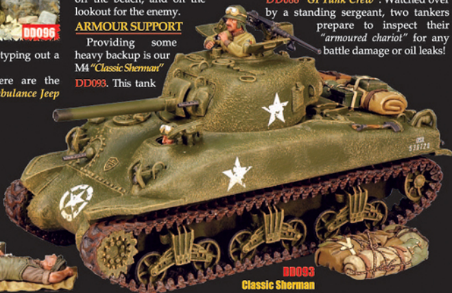
DD093 Classic Sherman