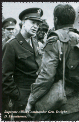
Supreme Allied Commander Gen. Dwight D. Eisenhower.

separate beaches codenamed... GOLD and SWORD (both British)... JUNO (Canadian) and OMAHA and UTAH (both American).