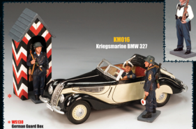
W5130 German Guard Box