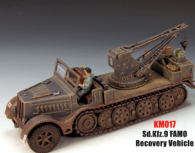
KM017 Sd.Kfz. 9 FAMO Recovery Vehicle