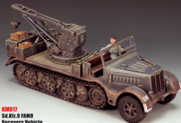
KM017 Sd.Kfz.9 FAMO Recovery Vehicle

His U47 sank 30 Allied vessels totaling over 200,000 tons before being sunk, with all hands, in March 1941.