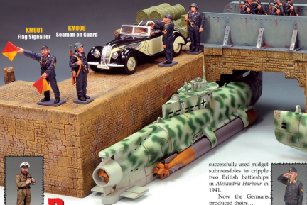
KM006 Seaman on Guard