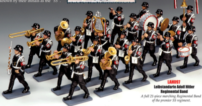
LAN097 Leibstandarte Adolf Hitler Regimental Band

And so began one of the most infamous and dreaded organizations in history... the "Schutzstaffel" better known by their initials as the "SS".