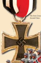
The Iron Cross Second Class.