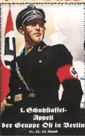
1. Schutzstaffel-Appell der Gruppe Ost in Berlin 11.-12.-13. August

The Allgemeine-SS also, because of their wide-spread network throughout the Reich, provided a ready supply of politically reliable "shock-troops" to protect the Regime physically.