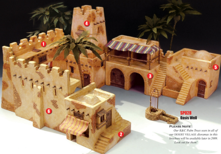
SP028 Oasis Well

Available around the world wherever fine quality military miniatures are sold.