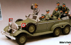
Hitler's Paris Visit

The French Army is defeated... the British have fled back to their island... France lies prostrate under the German jackboot... and Hitler decides to pay a visit to Paris!