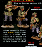
WS110 Hitlemen in Action

unique moment in history with WS106 'Hitler's Paris Visit' - a brand new version of the Führer and his entourage riding in one of their famous six-wheel