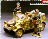
WS102 Normandy Kubelwagen

of the Russian Steppes" had excellent sloping armour... a top speed of 50km. per hour and... could cover over 300 kilometres without refueling. Even Germany's finest tank general Heinz Guderian admitted the T34 was "the best tank in the world".