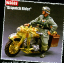
WS089 "Dispatch Rider"

Here, Speer is talking with one of his "OT" foremen.