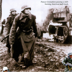
Panzer Grenadiers passing a still-burning American half-track.