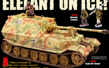
BBG013 Mountain Troopers