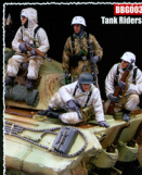
BBG003 Tank Riders

That was the bold and very ambitious plan and ... it almost succeeded!