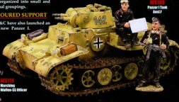
WS108 Panzer I Tank Ausf.I