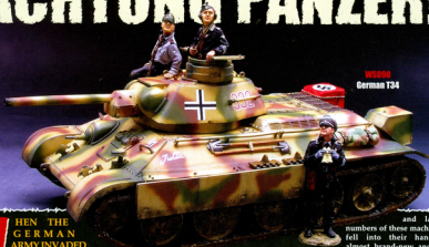
WS098 German T34